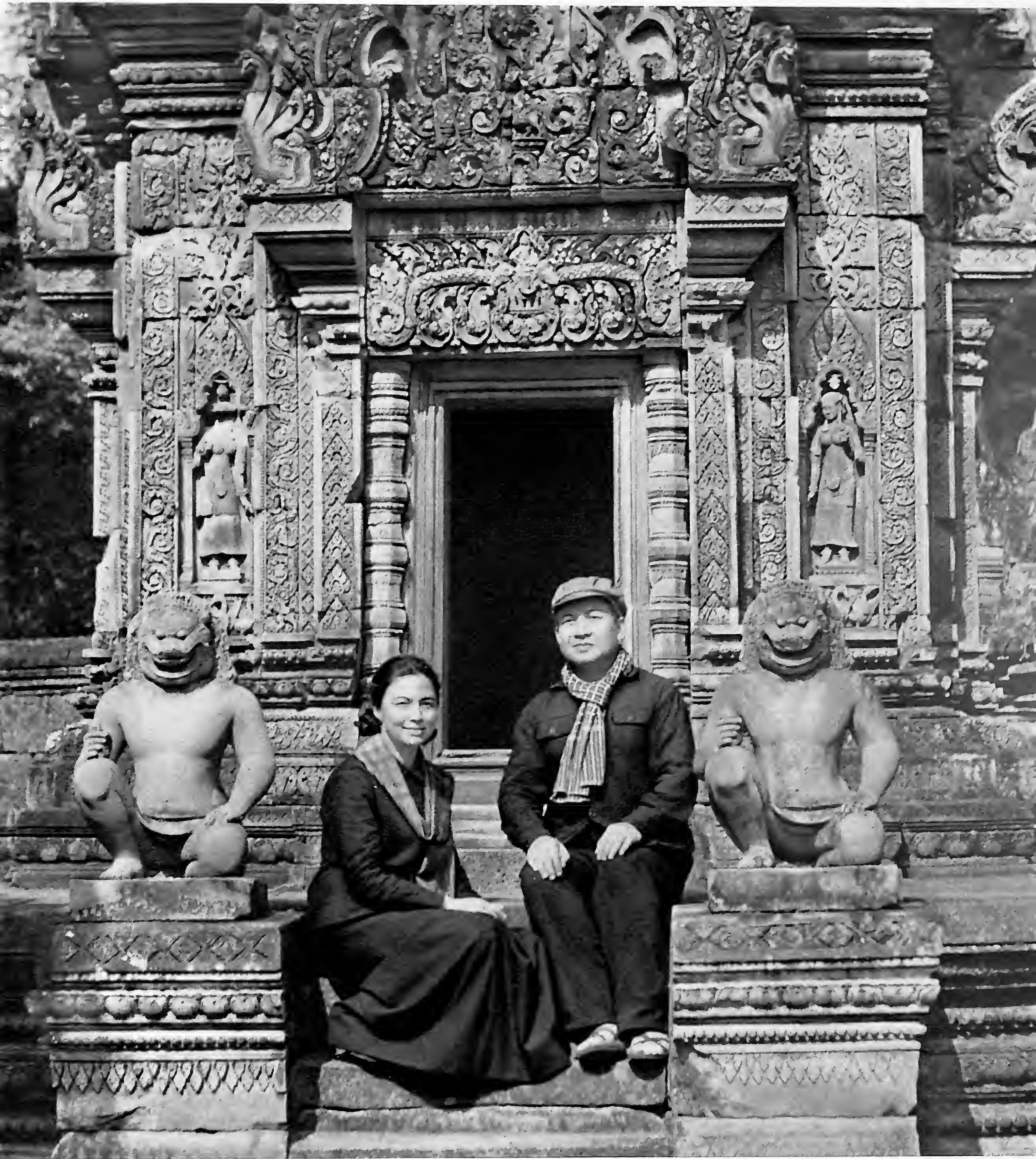
Samdech and Madame Sihanouk in front of the Temple of Banteay Srei.

Front Cover: Travelling along the Stung Treng-Phnom Penh national highway. The bullet-scarred milestone reads in Cambodian: "Phnom Penh, 525 kms". From left to right, front row: Madame Sihanouk, Mr. Khieu Samphan, Samdech Sihanouk, Mr. Hu Nim. They believe that the liberation of Phnom Penh is not far off. Back Cover: Samdech Sihanouk together with heroes and heroines of the Cambodian People's Resistance Movement.